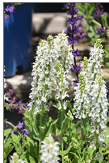
Snow Hill Sage flowers

Snow Hill Sage is a fine choice for the garden, but it is also a good selection for planting in outdoor pots and containers. It is often used as a 'filler' in the 'spiller-thriller-filler' container combination, providing a mass of flowers against which the larger thriller plants stand out. Note that when growing plants in outdoor containers and baskets, they may require more frequent waterings than they would in the yard or garden.