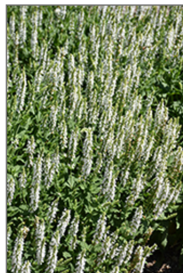
Snow Hill Sage flowers

Snow Hill Sage is recommended for the following landscape applications;