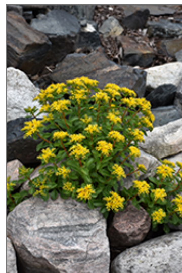
Russian Stonecrop in bloom