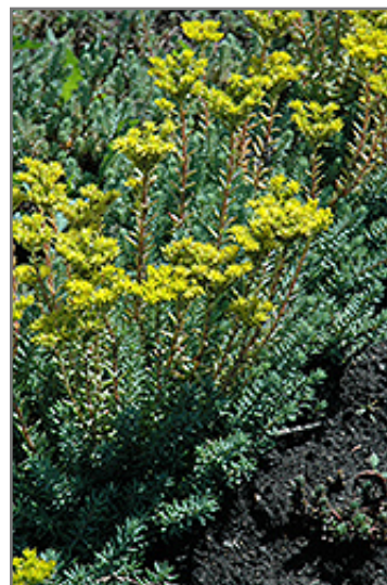
Blue Spruce Stonecrop flowers

Blue Spruce Stonecrop is smothered in stunning gold star-shaped flowers at the ends of the stems from early to mid summer. Its attractive succulent needle-like leaves remain silvery blue in color throughout the season.