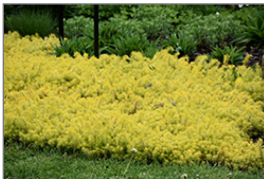
Angelina Stonecrop

This plant does best in full sun to partial shade. It prefers dry to average moisture levels with very well-drained soil, and will often die in standing water. It is considered to be drought-tolerant, and thus makes an ideal choice for a low-water garden or xeriscape application. It is not particular as to soil pH, but grows best in poor soils, and is able to handle environmental salt. It is highly tolerant of urban pollution and will even thrive in inner city environments. This is a selected variety of a species not originally from North America. It can be propagated by division; however, as a cultivated variety, be aware that it may be subject to certain restrictions or prohibitions on propagation.