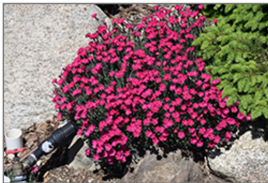
Paint The Town Red Pinks in bloom