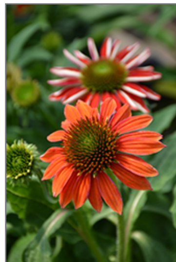
Artisan Red Ombre Coneflower flowers

Artisan Red Ombre Coneflower is recommended for the following landscape applications;