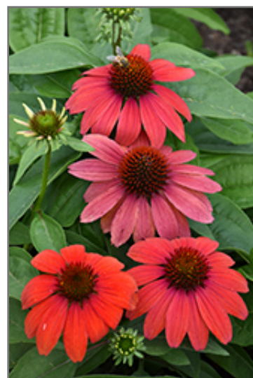
Artisan Red Ombre Coneflower flowers