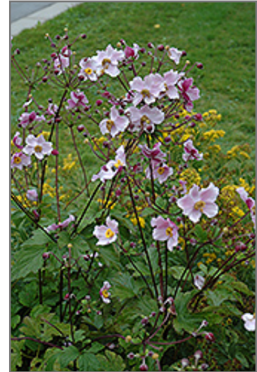
Grapeleaf Anemone flowers

This plant does best in full sun to partial shade. It prefers to grow in average to moist conditions, and shouldn't be allowed to dry out. It is not particular as to soil pH, but grows best in rich soils. It is somewhat tolerant of urban pollution. Consider applying a thick mulch around the root zone over the growing season to conserve soil moisture. This is a selected variety of a species not originally from North America. It can be propagated by division; however, as a cultivated variety, be aware that it may be subject to certain restrictions or prohibitions on propagation.