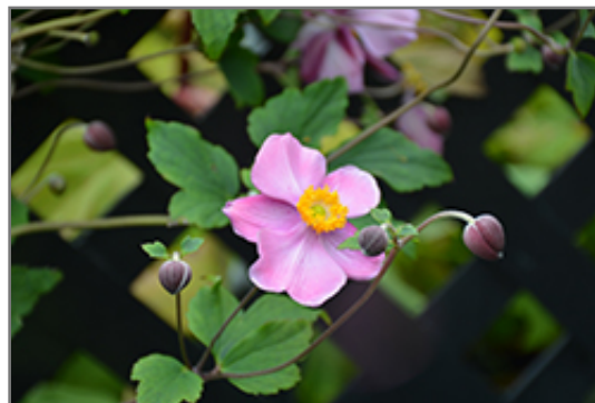
Grapeleaf Anemone flowers