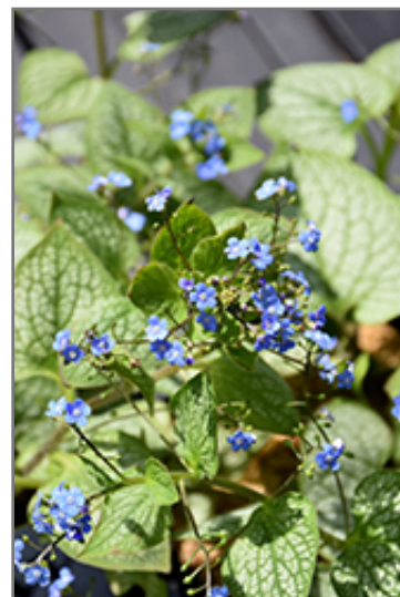
Jack of Diamonds Bugloss flowers

Jack of Diamonds Bugloss is recommended for the following landscape applications;