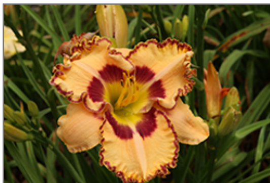
Rainbow Rhythm Lake of Fire Daylily flowers