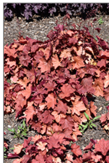
Carnival Cinnamon Stick Coral Bells