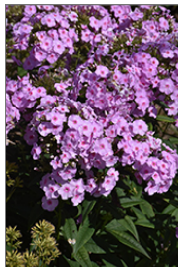
Luminary Opalescence Garden Phlox flowers

Luminary Opalescence Garden Phlox is recommended for the following landscape applications;