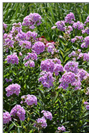
Luminary Opalescence Garden Phlox foliage