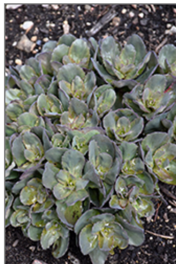
Rock 'N Grow Back in Black Stonecrop foliage