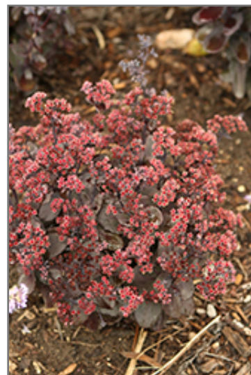
Rock 'N Grow Back in Black Stonecrop flowers

Rock 'N Grow Back in Black Stonecrop is a fine choice for the garden, but it is also a good selection for planting in outdoor pots and containers. With its upright habit of growth, it is best suited for use as a 'thriller' in the 'spiller-thriller-filler' container combination; plant it near the center of the pot, surrounded by smaller plants and those that spill over the edges. Note that when growing plants in outdoor containers and baskets, they may require more frequent waterings than they would in the yard or garden.