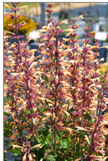
Meant To Bee Queen Nectarine Anise Hyssop flowers

Meant To Bee Queen Nectarine Anise Hyssop is recommended for the following landscape applications;