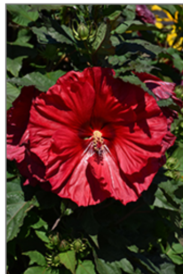
Summerific Valentine's Crush Hibiscus flowers

Summerific Valentine's Crush Hibiscus is recommended for the following landscape applications;