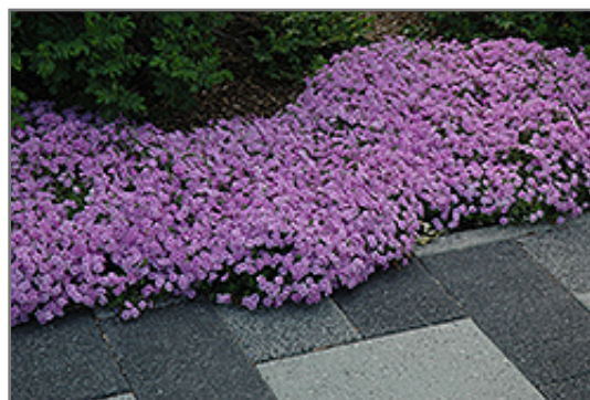
Fort Hill Moss Phlox in bloom