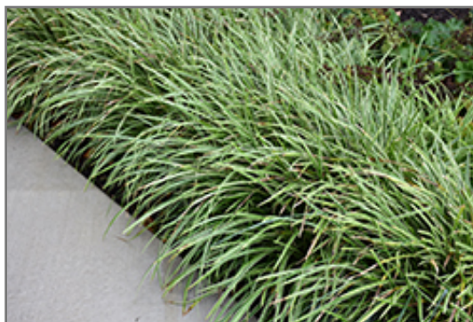
Ice Dance Sedge

Ice Dance Sedge will grow to be about 12 inches tall at maturity, with a spread of 15 inches. Its foliage tends to remain dense right to the ground, not requiring facer plants in front. It grows at a medium rate, and under ideal conditions can be expected to live for approximately 10 years. As an evergreen perennial, this plant will typically keep its form and foliage year-round.