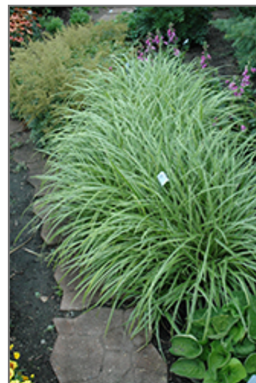
Ice Dance Sedge

Ice Dance Sedge is recommended for the following landscape applications;