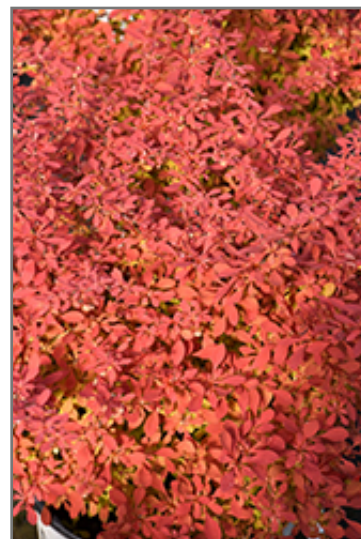
Sunjoy Neo Japanese Barberry foliage

Sunjoy Neo Japanese Barberry is recommended for the following landscape applications;