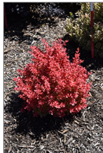
Sunjoy Neo Japanese Barberry

Sunjoy Neo Japanese Barberry makes a fine choice for the outdoor landscape, but it is also well-suited for use in outdoor pots and containers. It can be used either as 'filler' or as a 'thriller' in the 'spiller-thriller-filler' container combination, depending on the height and form of the other plants used in the container planting. It is even sizeable enough that it can be grown alone in a suitable container. Note that when grown in a container, it may not perform exactly as indicated on the tag - this is to be expected. Also note that when growing plants in outdoor containers and baskets, they may require more frequent waterings than they would in the yard or garden.