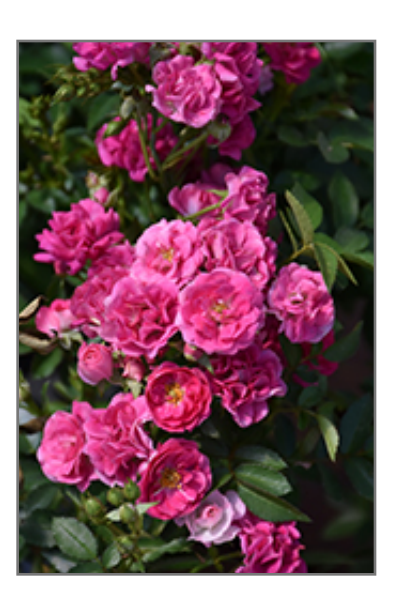
Oso Easy Peasy Rose flowers