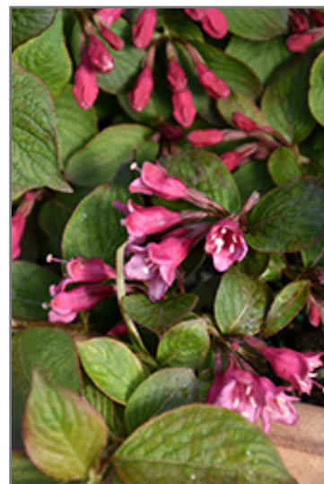
Midnight Sun Reblooming Weigela flowers

Midnight Sun Reblooming Weigela makes a fine choice for the outdoor landscape, but it is also well-suited for use in outdoor pots and containers. It is often used as a 'filler' in the 'spiller-thriller-filler' container combination, providing a mass of flowers and foliage against which the thriller plants stand out. Note that when grown in a container, it may not perform exactly as indicated on the tag - this is to be expected. Also note that when growing plants in outdoor containers and baskets, they may require more frequent waterings than they would in the yard or garden.