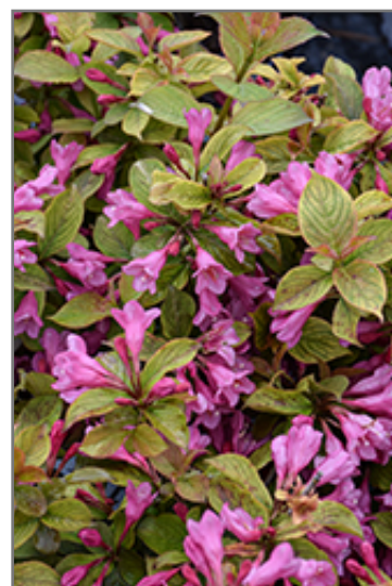
Midnight Sun Reblooming Weigela flowers