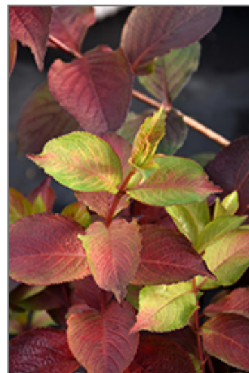
Midnight Sun Reblooming Weigela foliage