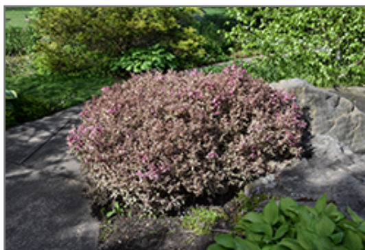
My Monet Purple Effect Weigela in bloom