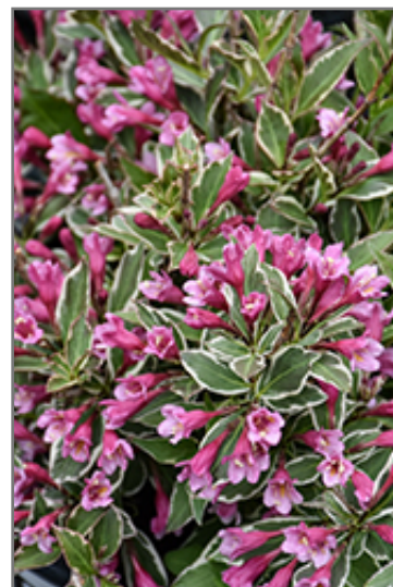
My Monet Purple Effect Weigela flowers

My Monet Purple Effect Weigela makes a fine choice for the outdoor landscape, but it is also well-suited for use in outdoor pots and containers. It can be used either as 'filler' or as a 'thriller' in the 'spiller-thriller-filler' container combination, depending on the height and form of the other plants used in the container planting. It is even sizeable enough that it can be grown alone in a suitable container. Note that when grown in a container, it may not perform exactly as indicated on the tag - this is to be expected. Also note that when growing plants in outdoor containers and baskets, they may require more frequent waterings than they would in the yard or garden.