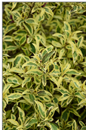
Bubbly Wine Weigela foliage

Bubbly Wine Weigela is recommended for the following landscape applications;