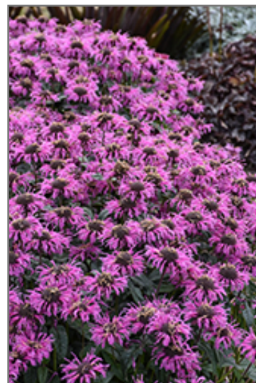
Upscale Lavender Taffeta Beebalm flowers

This plant will require occasional maintenance and upkeep, and should be cut back in late fall in preparation for winter. It is a good choice for attracting bees, butterflies and hummingbirds to your yard, but is not particularly attractive to deer who tend to leave it alone in favor of tastier treats. Gardeners should be aware of the following characteristic(s) that may warrant special consideration;