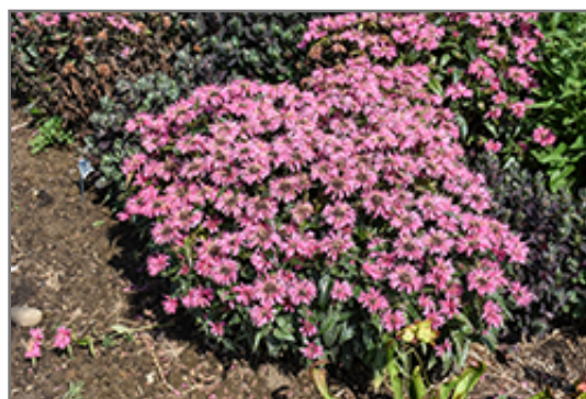
Upscale Pink Chenille Beebalm in bloom