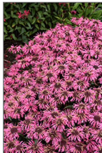
Upscale Pink Chenille Beebalm flowers

Upscale Pink Chenille Beebalm is an herbaceous perennial with a mounded form. Its medium texture blends into the garden, but can always be balanced by a couple of finer or coarser plants for an effective composition.