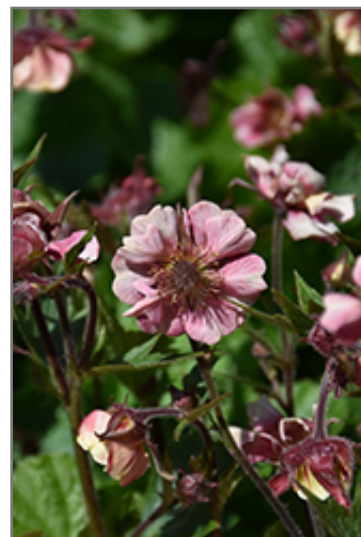
Tempo Rose Avens flowers

Tempo Rose Avens is recommended for the following landscape applications;