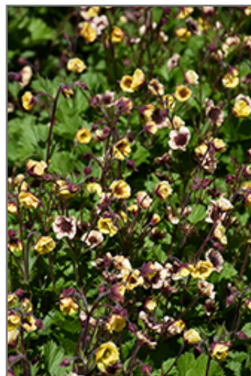
Tempo Yellow Avens flowers

Tempo Yellow Avens is recommended for the following landscape applications;