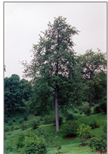
Black Cherry