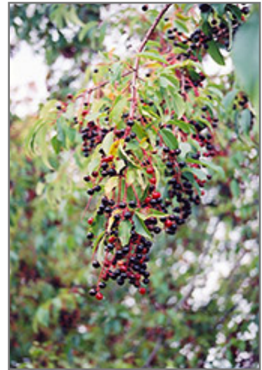
Black Cherry fruit

Black Cherry is a deciduous tree with a shapely oval form. Its average texture blends into the landscape, but can be balanced by one or two finer or coarser trees or shrubs for an effective composition.