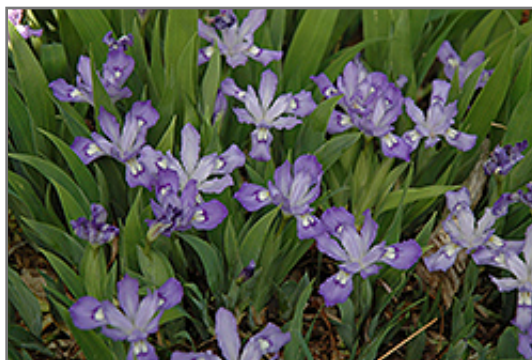
Dwarf Crested Iris flowers