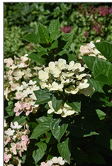
Early Evolution Hydrangea flowers