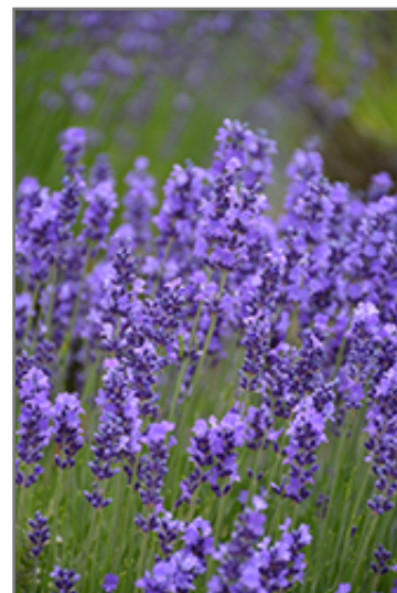
Hidcote Lavender flowers