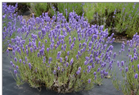
Hidcote Lavender in bloom