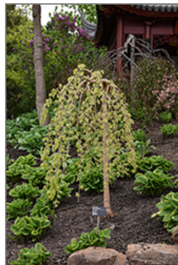
Chaparral Weeping Mulberry in bloom

This shrub performs well in both full sun and full shade. It is very adaptable to both dry and moist locations, and should do just fine under average home landscape conditions. It is considered to be drought-tolerant, and thus makes an ideal choice for xeriscaping or the moisture-conserving landscape. It is not particular as to soil type or pH, and is able to handle environmental salt. It is highly tolerant of urban pollution and will even thrive in inner city environments. This is a selected variety of a species not originally from North America.