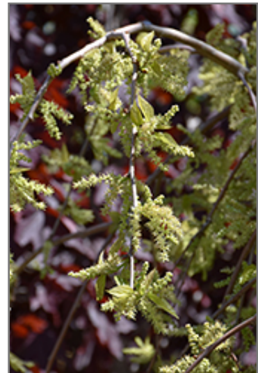
Chaparral Weeping Mulberry flowers