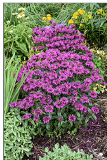
Electric Neon Purple Beebalm in bloom