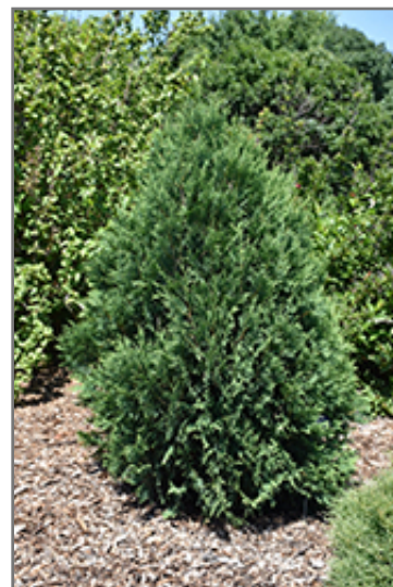
Technito Arborvitae