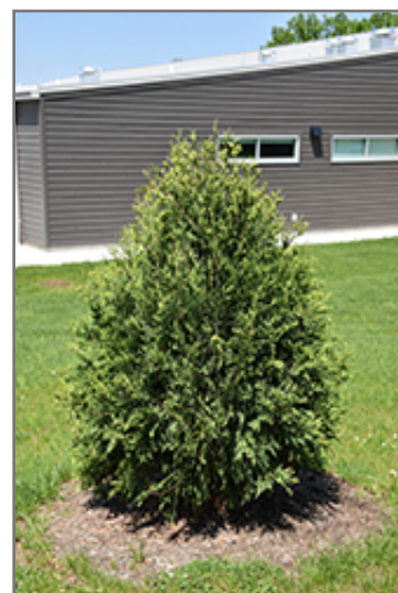
Technito Arborvitae