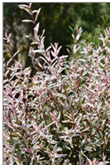
Tricolor Willow foliage

This shrub should only be grown in full sunlight. It is quite adaptable, preferring to grow in average to wet conditions, and will even tolerate some standing water. It is not particular as to soil type or pH. It is highly tolerant of urban pollution and will even thrive in inner city environments. This is a selected variety of a species not originally from North America.