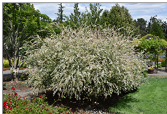
Tricolor Willow