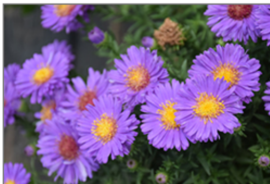
Woods Purple Aster flowers

Woods Purple Aster is recommended for the following landscape applications;