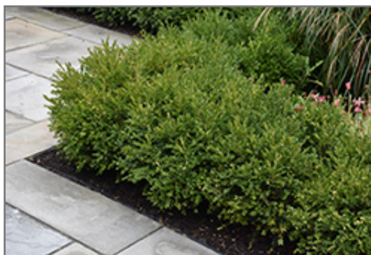
Green Gem Boxwood