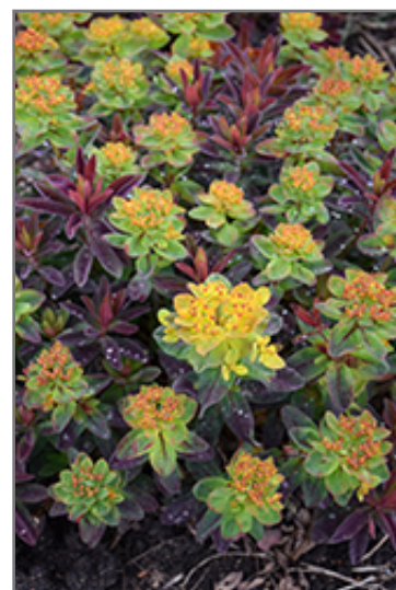
Bonfire Cushion Spurge flowers

Bonfire Cushion Spurge is recommended for the following landscape applications;