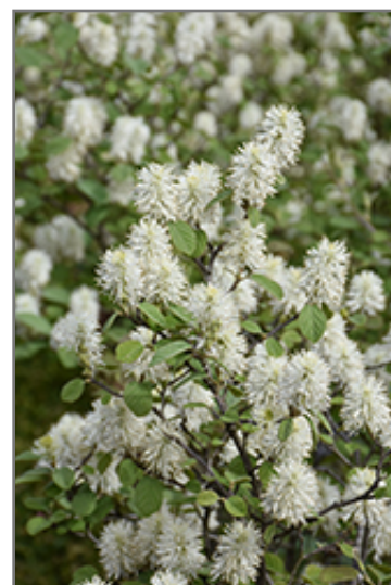
Blue Shadow Fothergilla flowers

Blue Shadow Fothergilla is recommended for the following landscape applications;