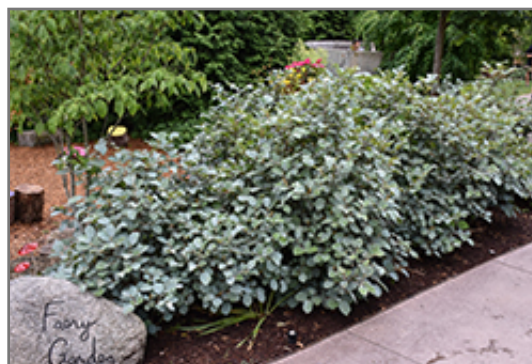
Blue Shadow Fothergilla