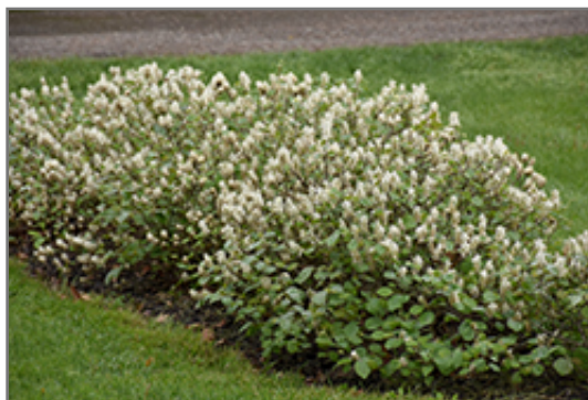
Blue Shadow Fothergilla in bloom

This shrub does best in full sun to partial shade. It requires an evenly moist well-drained soil for optimal growth, but will die in standing water. It is not particular as to soil type, but has a definite preference for acidic soils, and is subject to chlorosis (yellowing) of the foliage in alkaline soils. It is somewhat tolerant of urban pollution. This is a selection of a native North American species.