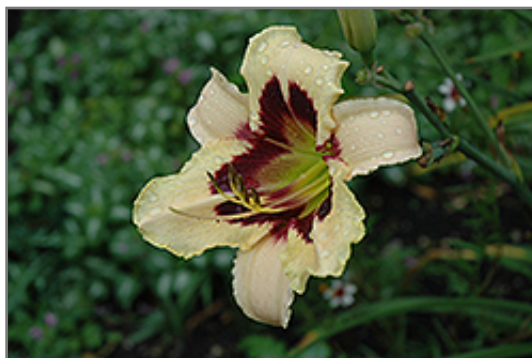
Moonlit Masquerade Daylily flowers

Reblooming, large, cream trumpets with dark purple band and yellow-green throat; sturdy, strong, easy to care for, great grassy texture and form; good for the beginner gardener and the pro