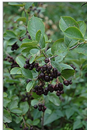
Black Chokeberry fruit