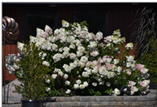
Vanilla Strawberry Hydrangea in bloom

This shrub performs well in both full sun and full shade. It prefers to grow in average to moist conditions, and shouldn't be allowed to dry out. It is not particular as to soil type or pH. It is highly tolerant of urban pollution and will even thrive in inner city environments. Consider applying a thick mulch around the root zone in winter to protect it in exposed locations or colder microclimates. This is a selected variety of a species not originally from North America.