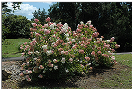
Vanilla Strawberry Hydrangea in bloom