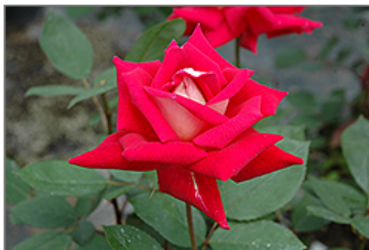
Love Rose flowers

This shrub should only be grown in full sunlight. It does best in average to evenly moist conditions, but will not tolerate standing water. It is not particular as to soil type or pH. It is somewhat tolerant of urban pollution. This particular variety is an interspecific hybrid.