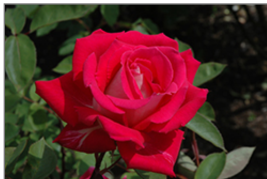
Love Rose flowers

Love Rose is recommended for the following landscape applications;