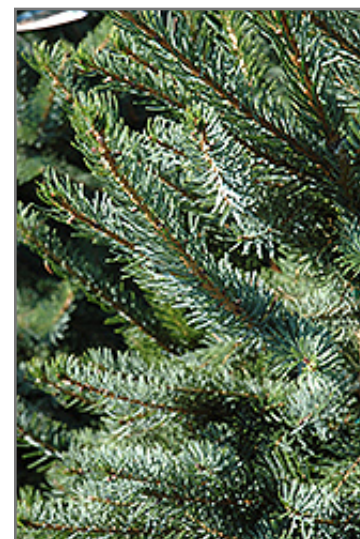
Bruns Spruce foliage