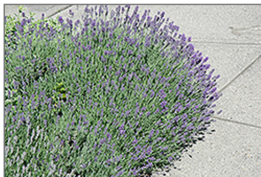
Munstead Lavender in bloom