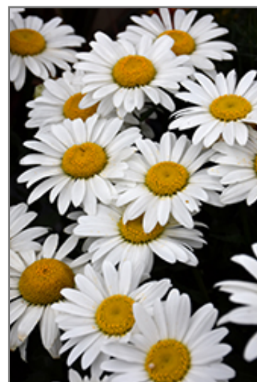
Snowcap Shasta Daisy flowers