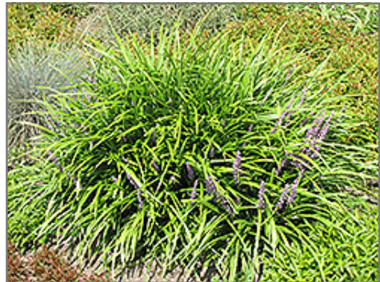
Lily Turf in bloom