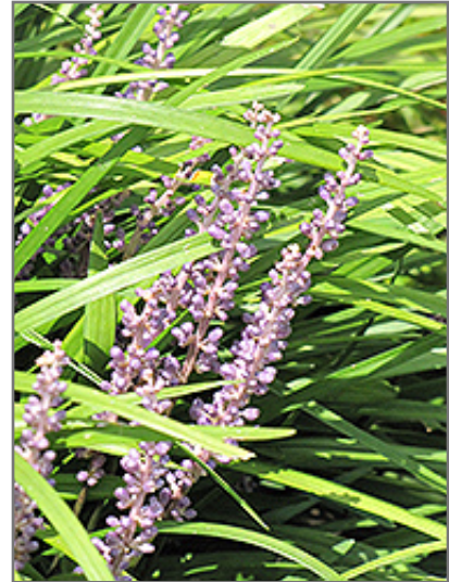
Lily Turf flowers