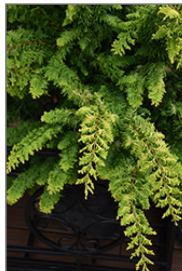
Fernspray Gold Falsecypress foliage