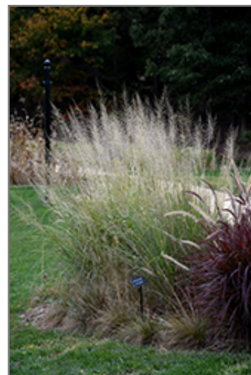
Prairie Dropseed fruit