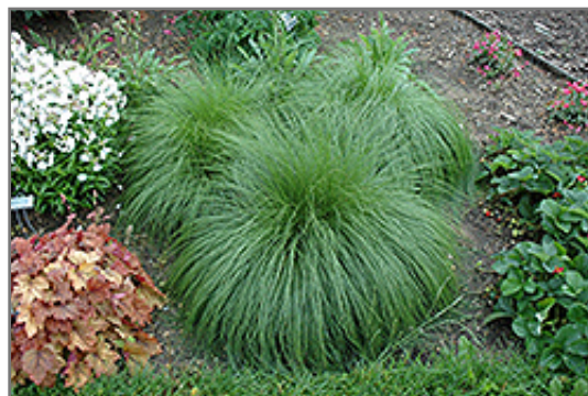
Prairie Dropseed

Prairie Dropseed is recommended for the following landscape applications;