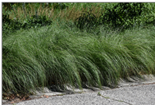
Prairie Dropseed

Prairie Dropseed will grow to be about 24 inches tall at maturity extending to 3 feet tall with the flowers, with a spread of 3 feet. Its foliage tends to remain dense right to the ground, not requiring facer plants in front. It grows at a medium rate, and under ideal conditions can be expected to live for approximately 10 years. As an herbaceous perennial, this plant will usually die back to the crown each winter, and will regrow from the base each spring. Be careful not to disturb the crown in late winter when it may not be readily seen!