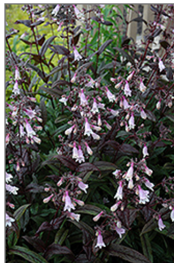
Dark Towers Beard Tongue flowers