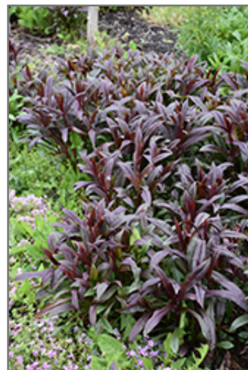
Dark Towers Beard Tongue

Dark Towers Beard Tongue is a fine choice for the garden, but it is also a good selection for planting in outdoor pots and containers. With its upright habit of growth, it is best suited for use as a 'thriller' in the 'spiller-thriller-filler' container combination; plant it near the center of the pot, surrounded by smaller plants and those that spill over the edges. It is even sizeable enough that it can be grown alone in a suitable container. Note that when growing plants in outdoor containers and baskets, they may require more frequent waterings than they would in the yard or garden.