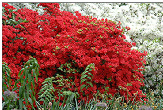
Stewartstonian Azalea in bloom