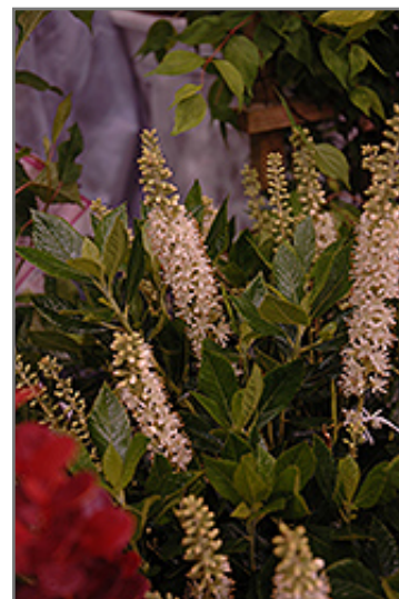
Sixteen Candles Summersweet flowers